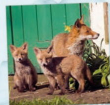
Above: Foxes breed once a year, with cubs being sighted playing in gardens in early summer.