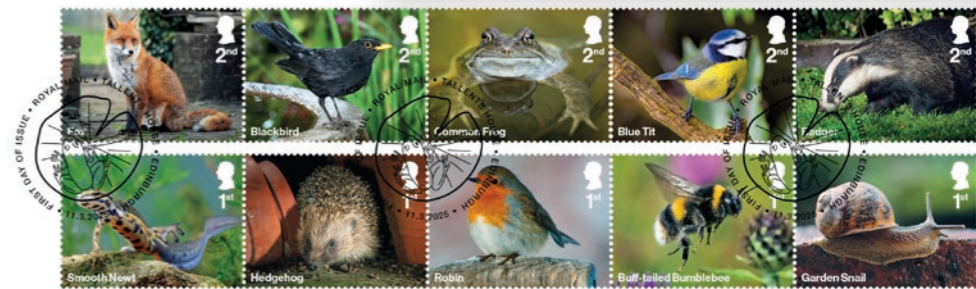
Below: Badgers are nocturnal.