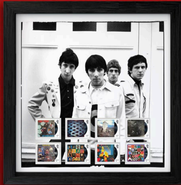
12 Framed Stamp Set | N3376 £39.99