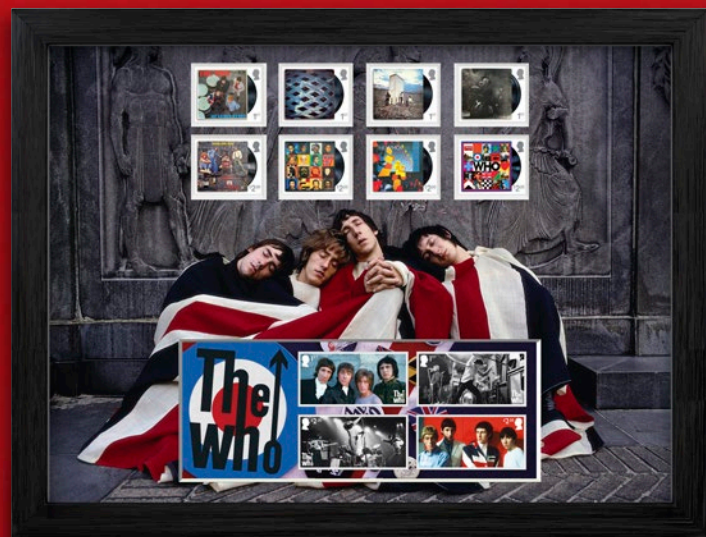
11 Framed Stamps and Miniature Sheet | N3377 £44.99